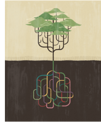
Converged Application Server readily processes IT and Network Traffic

The Oracle Communications Converged Application Server extends the proven WebLogic Server to manage real-time voice or video session. Built into the Converged Application Server are interfaces that allow programs to manage the SIP sessions, SIP application timers, application deployments, and SIP listeners. The Oracle Communications Converged Application Server is a container with a SIP stack that handles the dialog, transactions messaging, and transport messaging. With a single container model, businesses may rapidly develop and