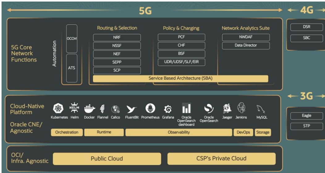
Image 2. Oracle Communications Cloud Native Core Network Functions Deployment Stack.

Deploy trusted, cloud native 5G technology from the network through BSS and OSS applications. Take advantage of automation in the 5G standalone core to bring new services to market faster.